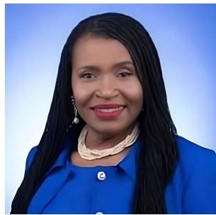
Commissioner Marleine Bastien