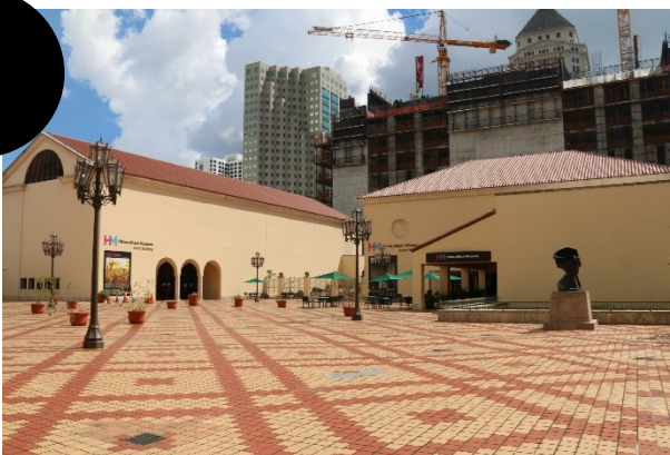
Cross the Miami-Dade Cultural Center Plaza to HistoryMiami Museum.