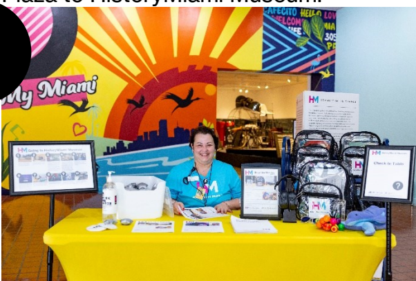
Check-in with museum staff in the Museum's North or South building lobby. There may be a line to wait in. At check-in, our staff will ask the name(s) you have registered under. Everyone will receive a wristband to wear.