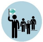
Tour Waiting Area